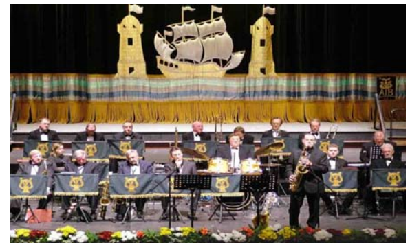
Academy Big Band Performance at Cork City Hall.