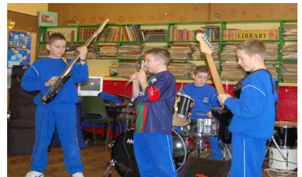
Outreach Programme to Local Schools.